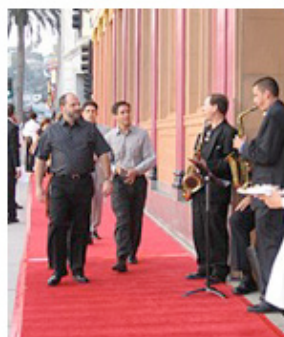
Guests stroll down the red carpet outside the Hollywood Museum.

Thanks to a Hollywood location, the movie-star quotient was high during the opening day of ISES Eventworld 2005, held Aug. 11-13 at the Renaissance Hollywood Hotel in Los Angeles. Almost 450 attendees from around the world made the trip to L.A., marking the best attendance in the conference's history.