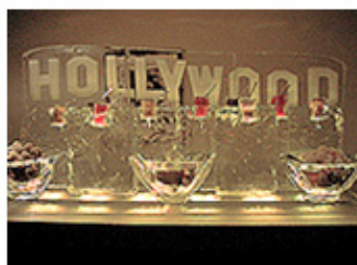
Ice Magic and Gourmet Celebrations designed a star-quality ice cream bar.

The progressive party ended on the museum's top floor, where Los Angeles-based caterer Gourmet Celebrations served dishes inspired by classic L.A. restaurants such as the Brown Derby and Polo Lounge, including petite eggplant Napoleons, country-style meatloaf stack, stuffed chicken and cobb salad. For dessert, Ice Magic of Santa Fe Springs, Calif., worked with Gourmet Celebrations to design an elaborate ice cream bar that featured a carved-ice re-creation of the famed Hollywood sign. During dinner, L.A.-based