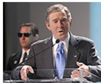
A George W. Bush impersonator addressed the crowd at the opening general session...

During the opening general session, performers from San Diego-based Imagination Entertainment