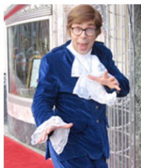
...then changed costumes to become Austin Powers.